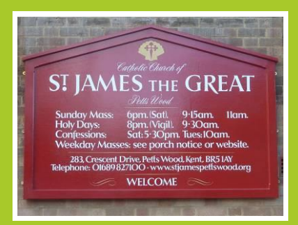
Our church sign