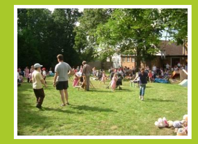
Our church garden