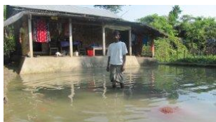
The 2011 flood

Bangladesh lies roughly between India and Burma, and is south of China