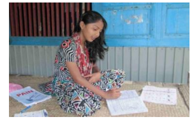
Bijoli's daughter studies hard