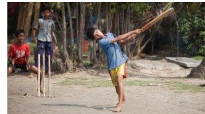
Cricket in Kainmari