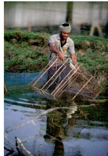
Probita tends his shrimp farm

What our money could buy £23 will buy baby shrimps, a bamboo basket, and training for a family to start their own shrimp farm. £35 will buy 25 ducklings, fencing and training for a family to start their own duck farm. £200 will pay for seed, fertiliser, fencing materials and training for five families to start a vegetable garden and fruit orchard.